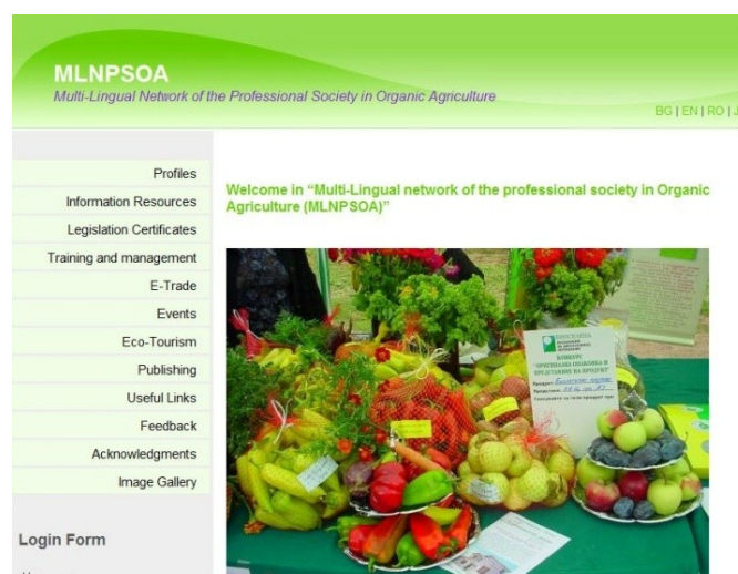
Fig.1 Firtst page of MLNPSOA